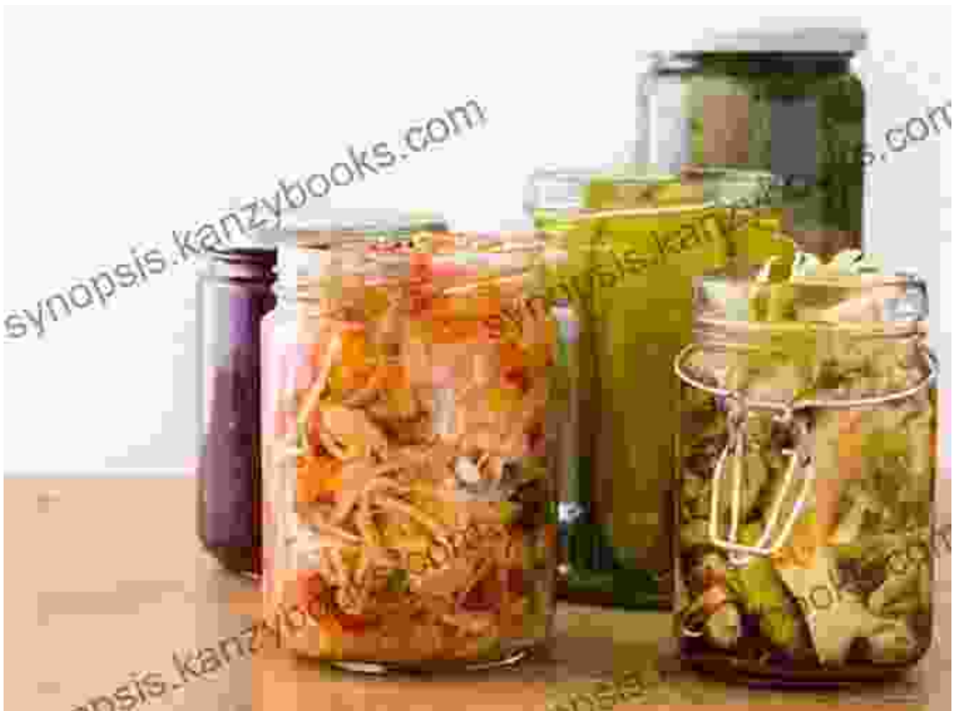
A Culinary Tour of the Seasons