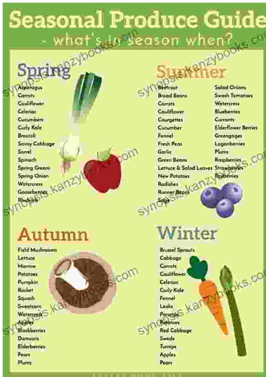
Beyond Recipes: A Celebration of Farm Life

Our Best Farm Fresh Recipes celebrates the changing seasons, highlighting the unique flavors of each harvest. Spring brings forth asparagus, tender peas, and sweet berries. Summer bursts with juicy tomatoes, crunchy cucumbers, and aromatic herbs. Autumn offers a kaleidoscope of colors with apples, pumpkins, and root vegetables. And winter provides comfort in hearty soups, stews, and baked goods.